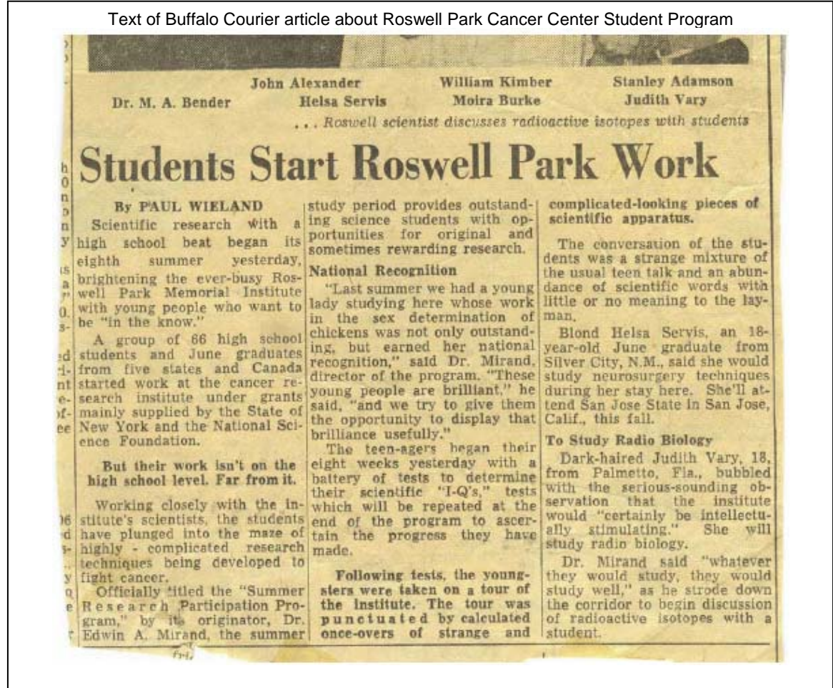
Text of Buffalo Courier article about Roswell Park Cancer Center Student Program